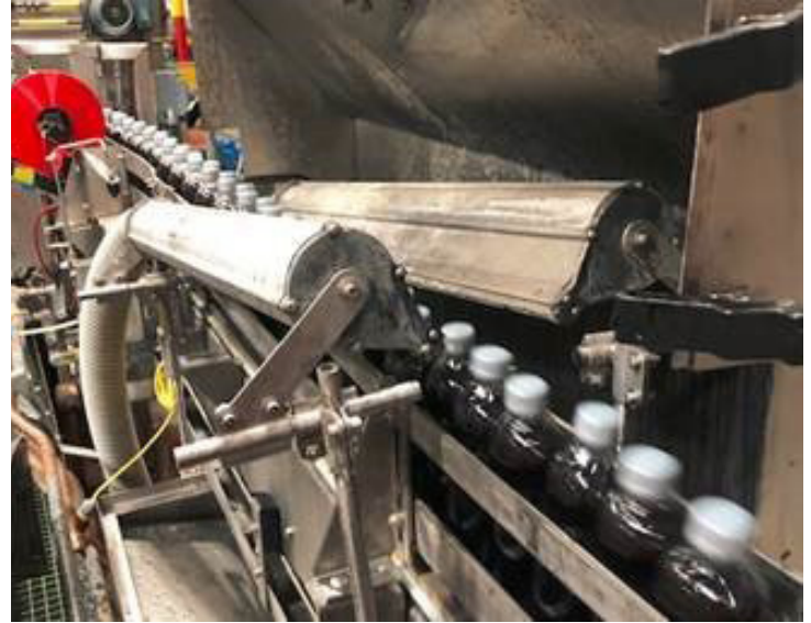
Old Air Knife System

Both the CapDryer System and the air knives will be powered by one PX-2000 blower, with a blower enclosure to reduce noise and protect the blower from any water spray or washdown chemicals. The PX-2000 blower generates 1350 cfm at 35 inches of water column, at an efficiency of 76%. Paxton's most advanced blower, the PX-2000 comes with a full three-year warranty.